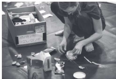
■ Oblivion.